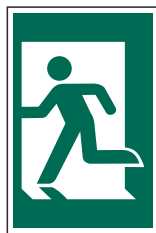
P 200 x 300 PVC 1501