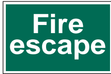
P 300 x 200 PVC 1514