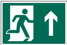
P 300 x 200 PVC 1528 U 600 x 400 PVC 4204