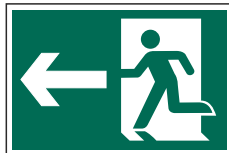
P 300 x 200 PVC 1531 U 600 x 400 PVC 4207