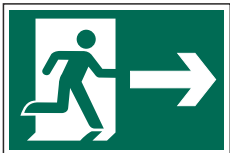
P 300 x 200 PVC 1530 U 600 x 400 PVC 4206