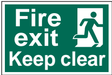
P 300 x 200 PVC 1513