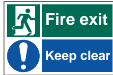
P 300 x 200 PVC 1540