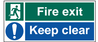
* 450 x 200 SAV 12132 * 450 x 200 RPVC 12133 * 600 x 200 SAV 12134 * 600 x 200 RPVC 12135