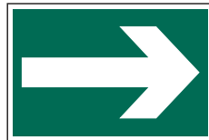
P 300 x 200 PVC 1521