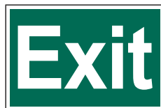
P 300 x 200 PVC 1515 U 600 x 400 PVC 4208