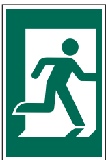
P 200 x 300 PVC 1500