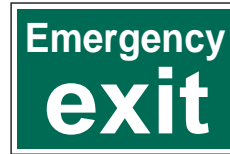
P 300 x 200 PVC 1516