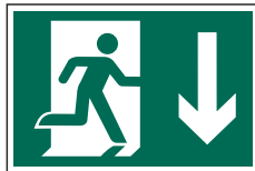
P 300 x 200 PVC 1529 U 600 x 400 PVC 4205