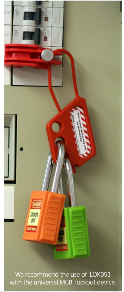
We recommend the use of LOK053 with the universal MCB lockout device.