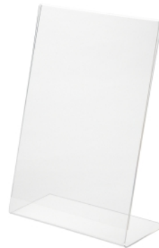
Desktop Sign Holder