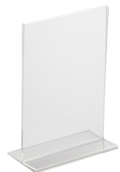
Desktop Double-Sided Sign Holder

Manufactured from injection moulded crystal clear acrylic these holders are ideal for displaying a range of brochures and leaflets.