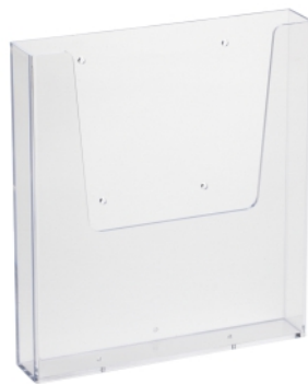
Wallfix Literature Holder