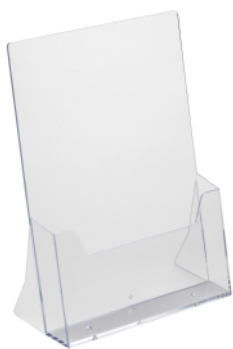
Desktop Literature Holder